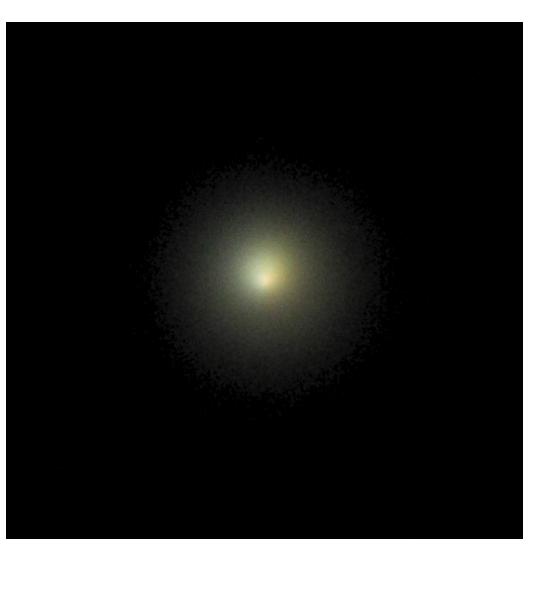
H.A.S. P.O. Box 17671 Honolulu, HI 96817

Comet 17-P/Holmes