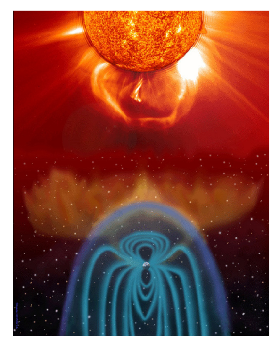
In spite of Earth's protective magnetosphere, solar storms can wreak havoc with Earth satellites and other expensive electronics on the ground.

Hawaiian Astronomical Society P.O. Box 17671 Honolulu, HI 96817-0671