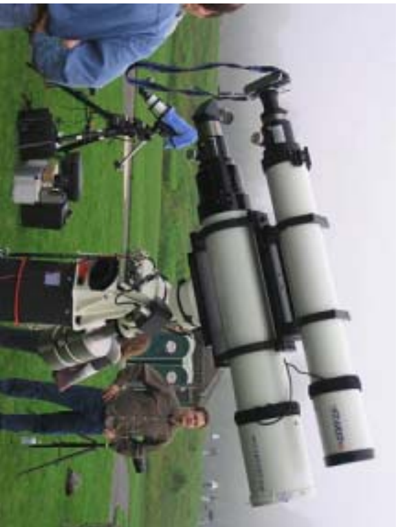
Large Astro Physics refractors are guaranteed cloud magnets.

Place stamp here. Post Office will not deliver mail without proper postage