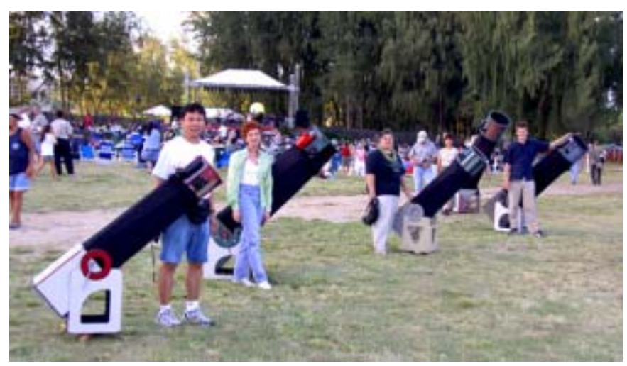
HAS Members provide hot stars to go with the cool jazz (or is that cool stars to go with the hot jazz?) at the Hawaii International Jazz Festival.

The HAS Quarterly Telescope Workshops are open to all HAS members and guests. If you know someone who has bought (or is considering purchasing) an ETX and is having trouble, please feel free to bring them along.