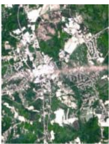
These images, made from EO-1 data, are of La Plata, Maryland, before (left) and after (right) a tornado swept through May 1, 2002.

great loss for the scientific community. EO-1, which gazes back at Earth's surface instead of out at the stars, provides about 20 times more detail about the spectrum of light reflecting from the landscape below than other Earth-watching satellites, such as Landsat 7.