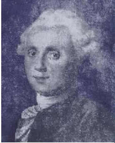
Charles Messier (1730-1817)

Messier objects are some of the prettiest objects to observe in any night sky, so even if you never participate in a marathon, at