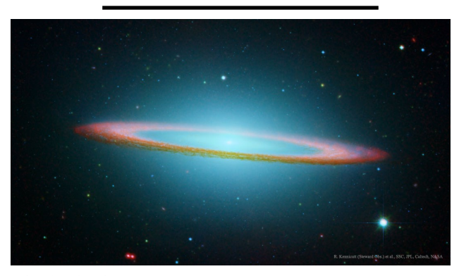
The Sombrero Galaxy in Infrared

September meteors - This \alpha -Aurigids (206 AUR) shower produced high rates on 2008 September 9 and another bright-meteor event with a very sharp peak in 2013 but no later unambiguous increase subsequently.