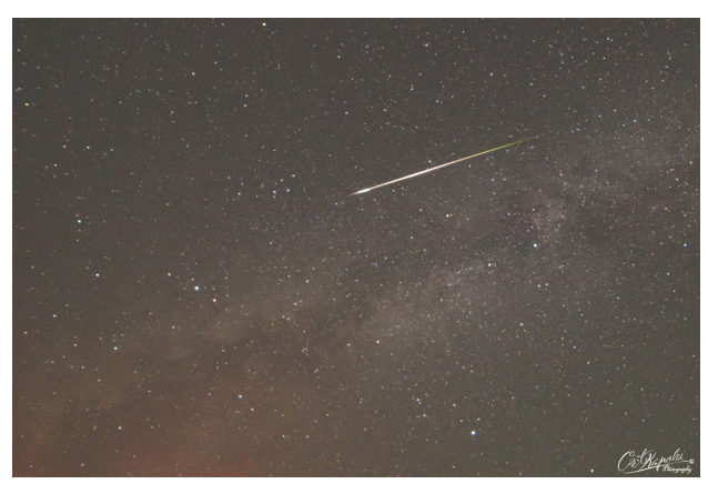
Perseid captured on Ort's time exposure.